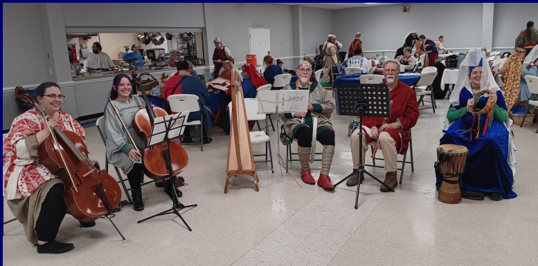
Live Music for Dance at Twelfth Night