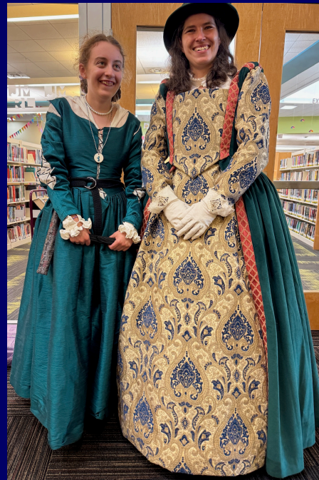
Master and Apprentice at the Northside Demo

Please submit photos of dancing at events to the Chronicler, so they can be featured here!