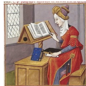
De Mulieribus Claris - Eriphila. Circa. 1488-1496. From De Mulieribus Claris. https://commons.wikimedia.org/wiki/File:De_mulieribus_claris_(BnF_Français_59_9)_f.18v_-_Eriphila.jpeg