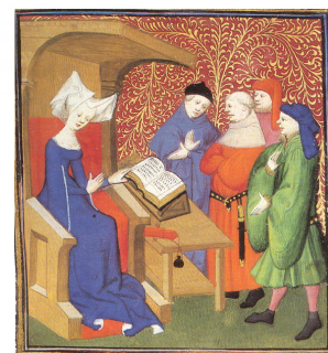
Pisan, Christine. An illustration from a compendium of her works.