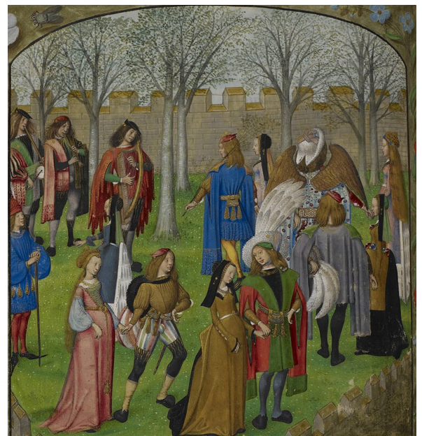
The Carolle in the Garden. Circa. 1490-1500. From Roman de la Rose. https://commons.wikimedia.org/w/index.php?title=File:The_Carolle_in_the_Garden_-_Roman_de_la_Rose_(c.1490-1500).f.14v_-_BL_Harley_MS_4425.jpg&oldid=1009352880