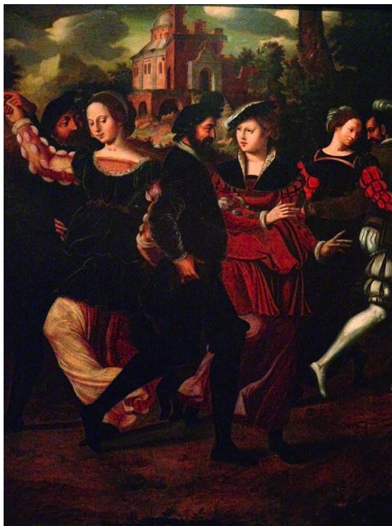
Benson, Ambrosius. Elegant Couples Dancing in a Landscape . Circa. 1540. Wood. Utah Museum of Fine Arts, Salt Lake City