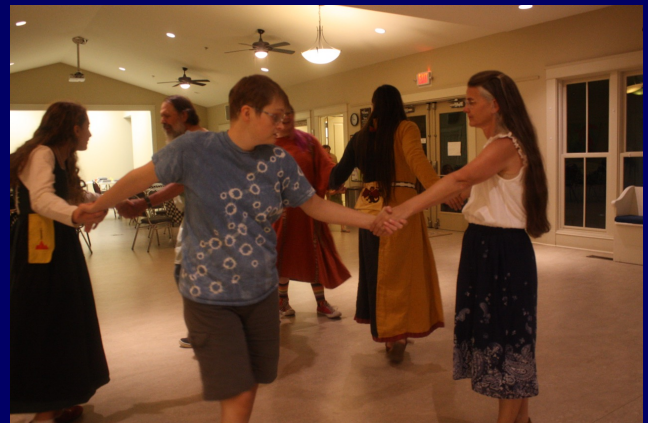
Old Mole