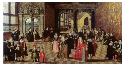
de Caulery, Louis. Social gathering at the palace. Circa. 1610. https://commons.wikimedia.org/wiki/File:Louis_de_Caulery_-_Zebranie_towarzyskie_w_palacu.jpg