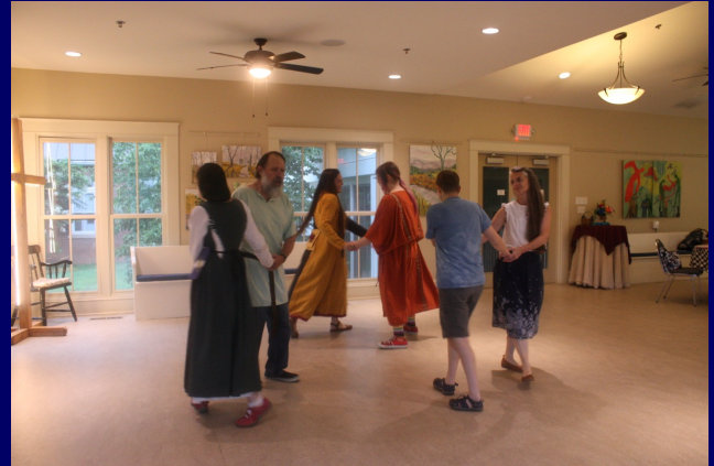
Epping Forest