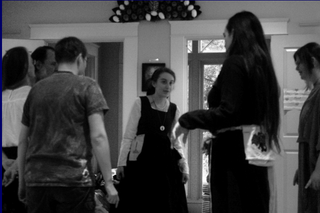
Dance at the Pennsic Procratination Party Image Credit: Giovanni di Ponza