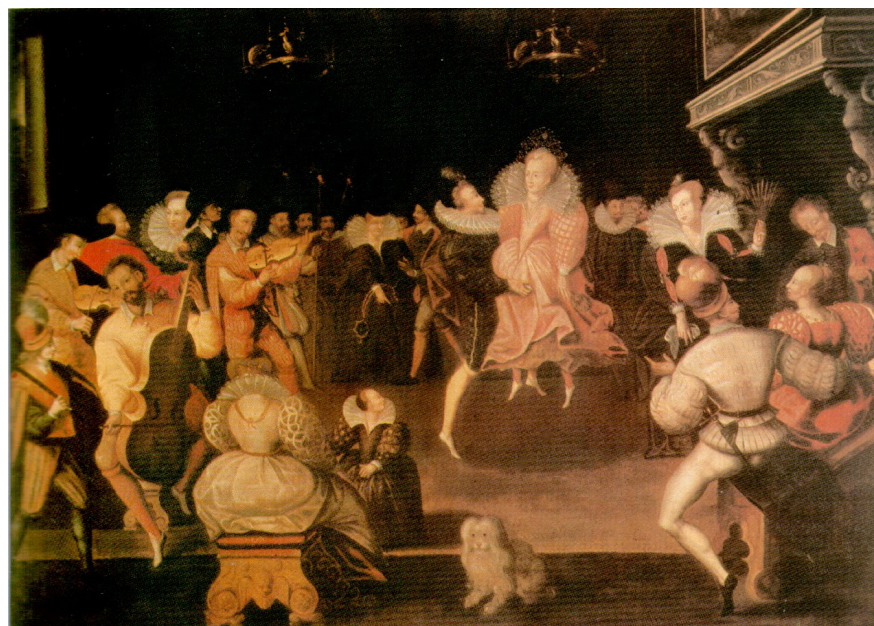
Queen Elizabeth I Dancing with Robert Dudley, Earl of Leicester. Circa 1580. Penshurst Place, Kent. File:Robert_Dudley_Elizabeth_Dancing.jpg