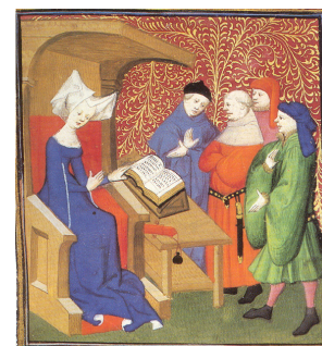
Pisan, Christine. An illustration from a compendium of her works.

The next Academie meeting will be Wednesday, September 10, 7:30-8:30 pm EST. The agenda is still tentative (and not in the right order), the final version will be provided via email closer to the meeting. The current agenda is just a rough idea of topics that will be brought up at the meeting.