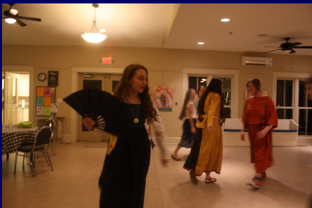
Ly Bens Distonys Image Credit: Giovanni di Ponza