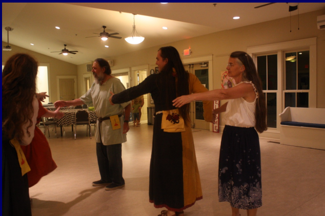
Old Mole Image Credit: Giovanni di Ponza